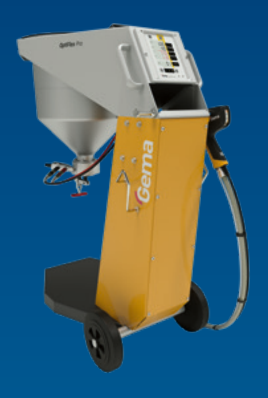
OptiFlex® Pro S