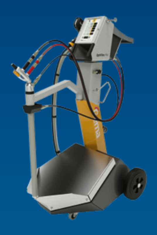
OptiFlex® Pro Q